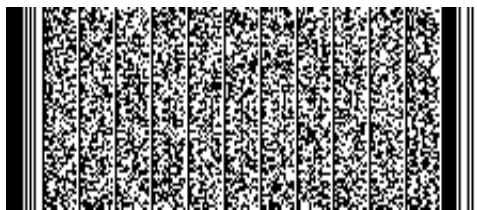
Timbre electrónico SRCel

Verifique documento en www.registrocivil.gob.cl o a nuestro Call Center 600 370 2000, para teléfonos fijos y celulares. La próxima vez, obtén este certificado en www.registrocivil.gob.cl .