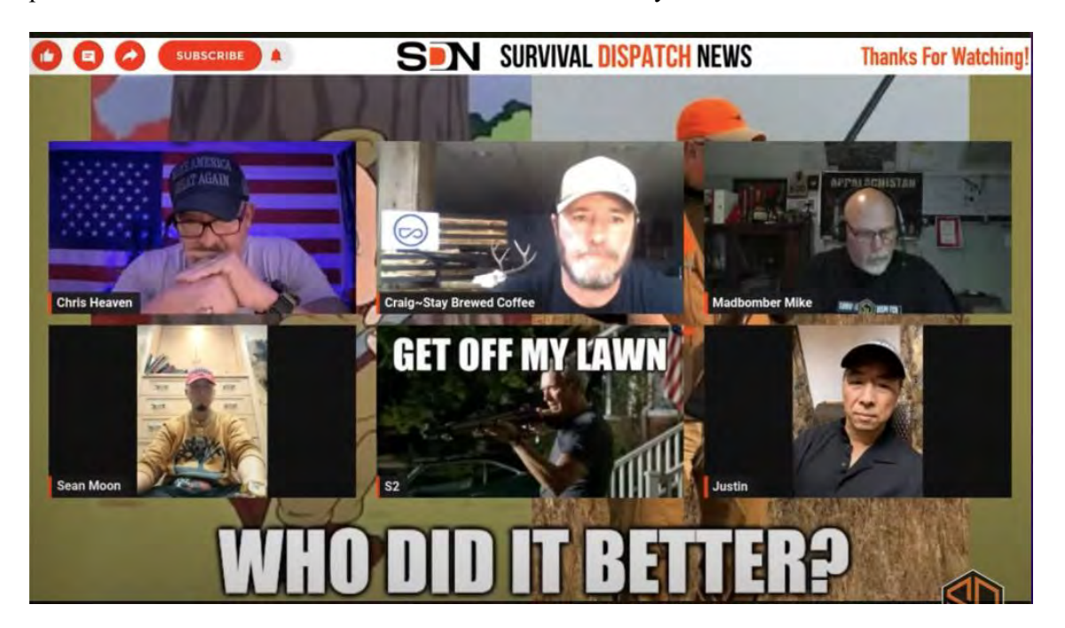
The 2 BROTHERS UNITED appeared on a Gun Owners Voting panel discussion

There is no reason to fight Russia. We could work to reduce the influence of CCP. More gas/oil production will weaken enemies and boost the U.S. economy.