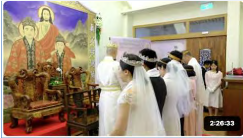
Holy Blessing in Taiwan, October 10, 2025

He decided to make a new start by moving to Fargo, North Dakota. He got a job welding, but still was alcoholic. Satan was whispering to him to commit suicide and to murder others, but he told himself he didn't want to kill anyone. He attended an Alcoholic Anonymous meeting, but was going to leave. Near the door another man said to him, "I can tell the living hell you are going through. It's not because you are a bad person, you have a disease, but you can be healed of that."