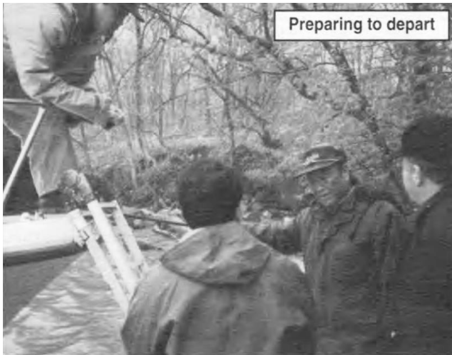
May 4, 1996, departing the Unification Theological Seminary, Barrytown, NY by boat

Everything is open with true love; unevenness is overcome and there is no shadow in front of love. Nothing but only true love can gain perfect freedom!